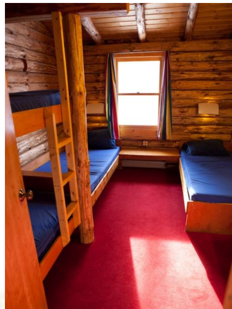
Women's Bed Room 1

A: While there are some limited banks in the town of Waitsfield, on bus trips we do not make individual stops to shops, stores, etc. There are ATMs at the Sugarbush Mountain; however, there are some limits on withdrawals and hefty service fees.